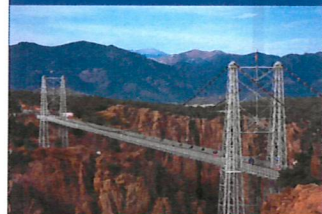
Visit to the Royal Gorge Bridge and Park