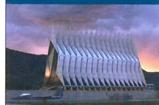
Visit to the U.S. Air Force Academy