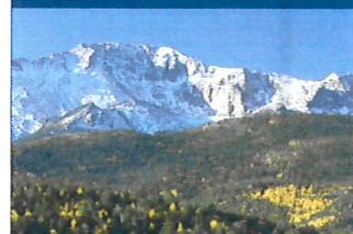
Famous Pikes Peak - America's Mountain